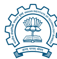
Indian Institute of Technology Bombay