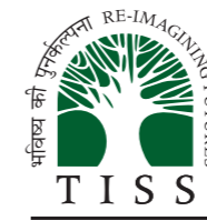
Tata Institute of Social Science